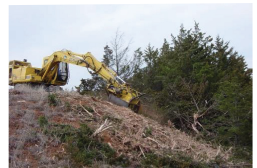
Suppression of mature woody plants with heavy equipment.

The stages of woody encroachment and corresponding management actions and priorities.