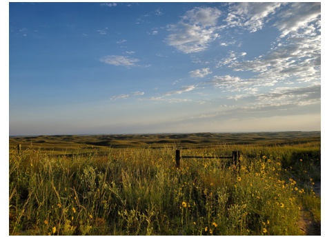
Intact grassland landscape in the Nebraska, Sandhills.

Suppression requires the right practices in the right place at the right time. Use prescribed fire, mechanical clearing, or chemical treatments to remove mature trees and then follow up with additional treatments to deplete the seedbank and prevent re-infestation.