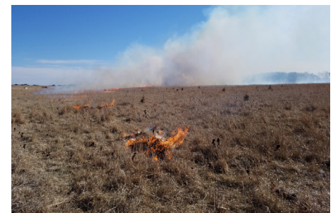
A prescribed fire used to target seedlings.